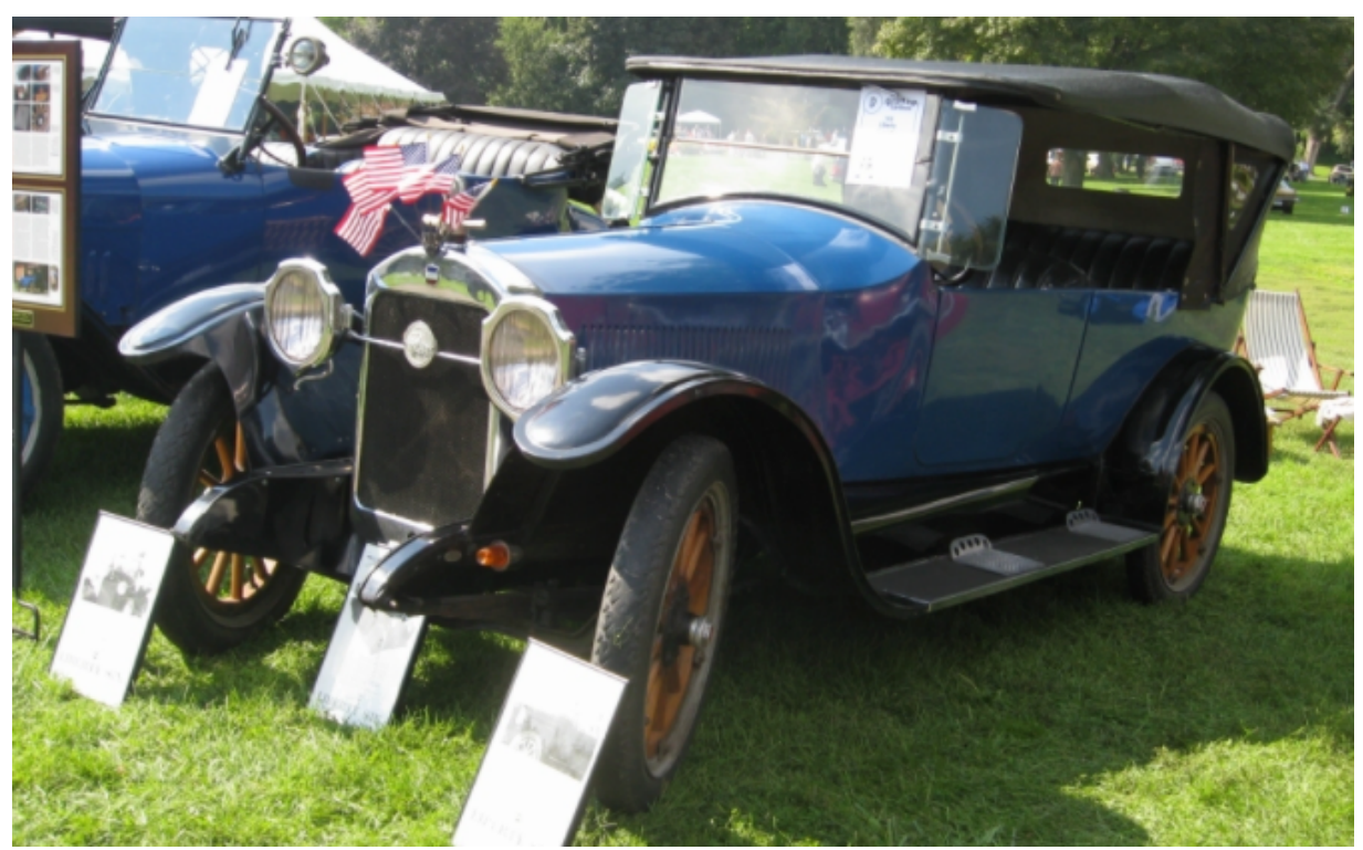
Sample of one of the few remaining Liberty Motor cars.